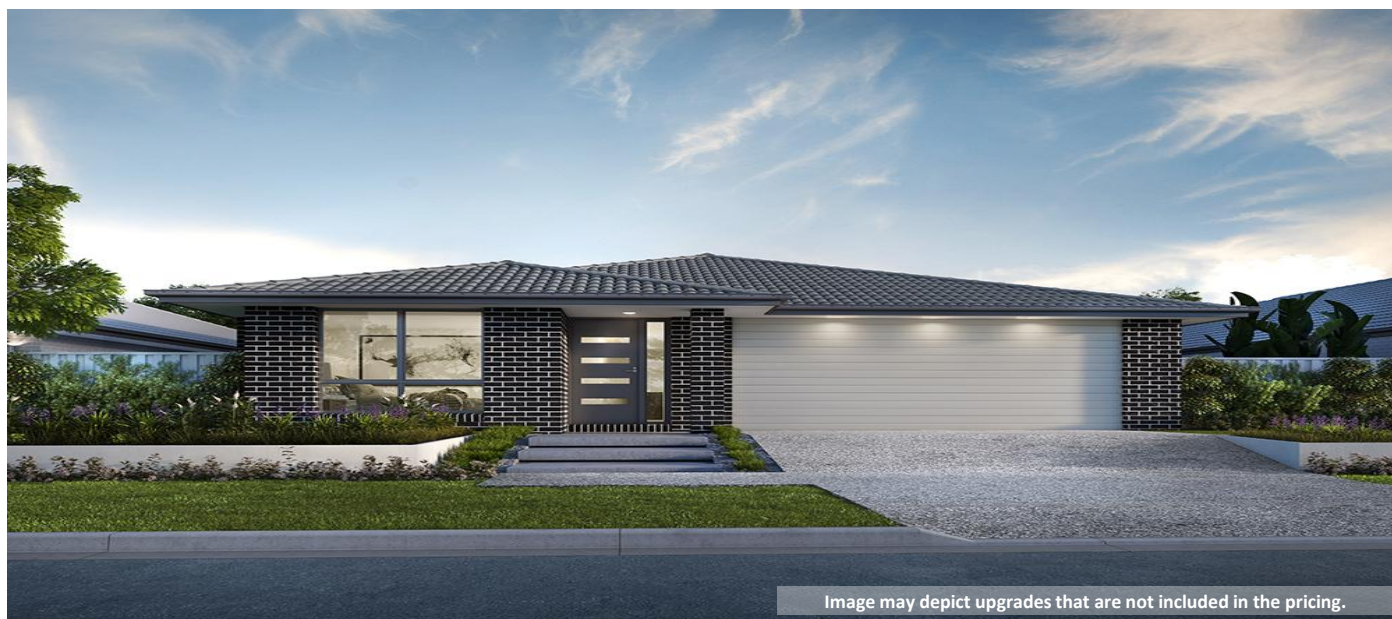
Image may depict upgrades that are not included in the pricing.

Floor area: 235.37m 2 / 25.34sq | Frontage: 11.21 Depth: 24.44m