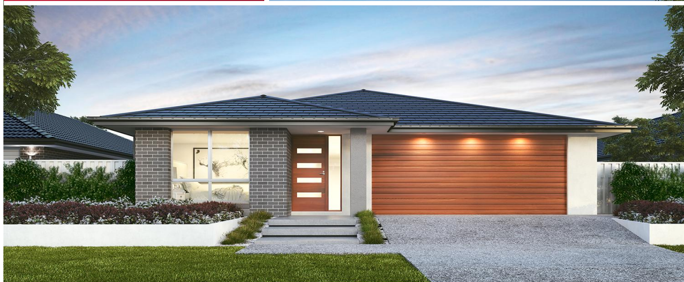
Image may depict upgrades that are not included in the pricing.

Floor area: 250.74m 2 / 26.99sq | Frontage: 12.67m Depth: 22.67m