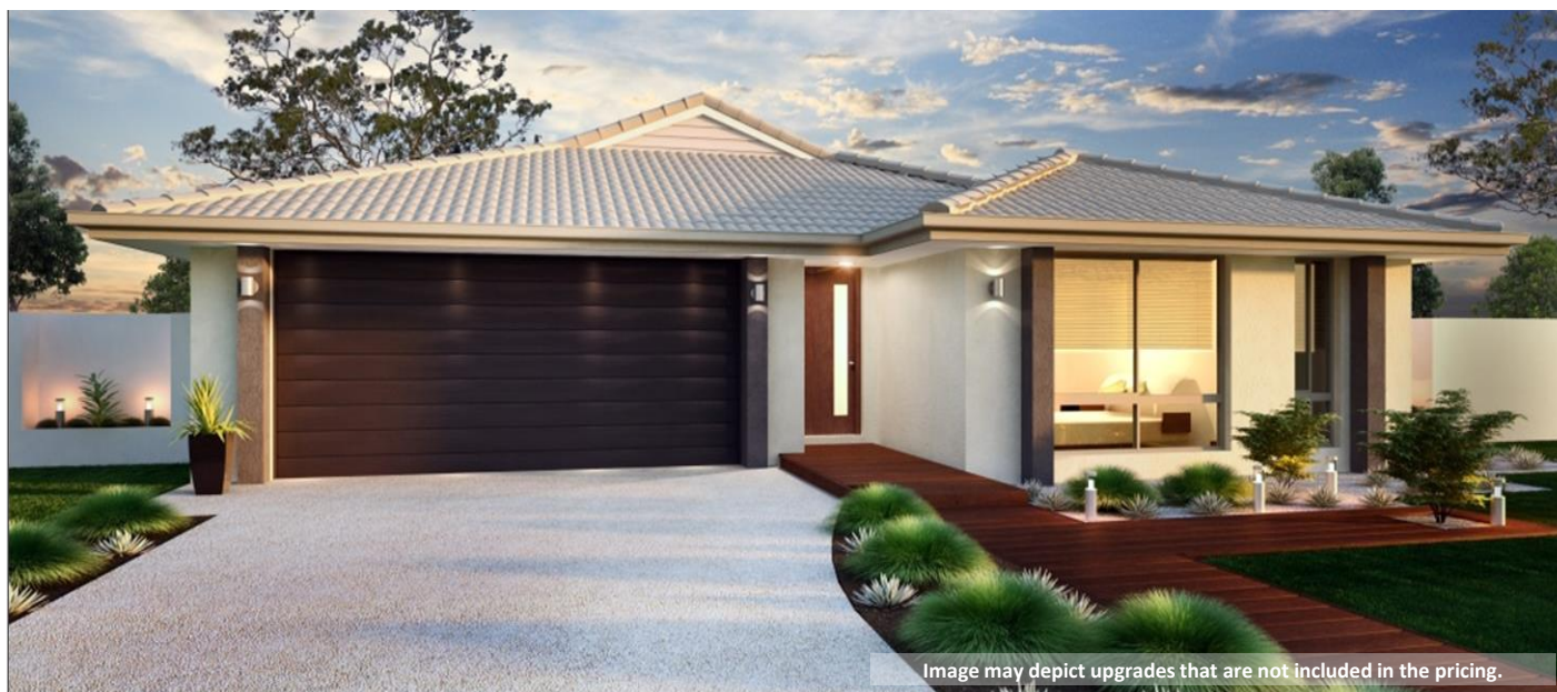
Image may depict upgrades that are not included in the pricing.

Floor area: 205.18m 2 / 22.09sq | Frontage: 12.85m Depth: 18.42m